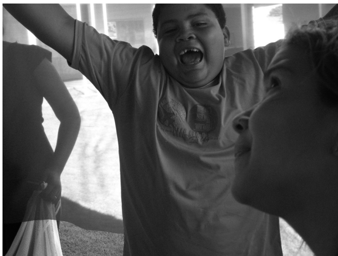
Students rehearse performances of a fairy tale.