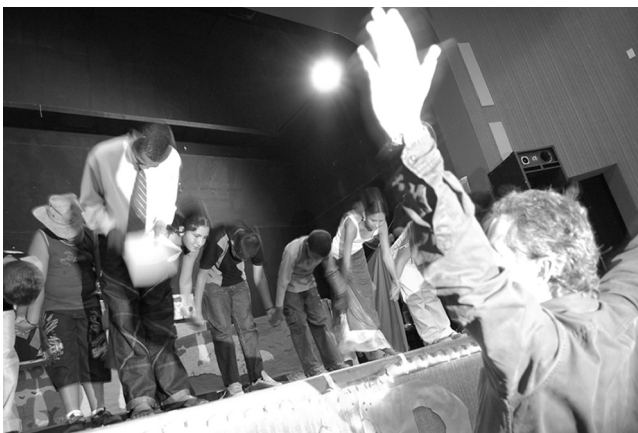
Students perform in the city hall in Inhumas, Brazil.