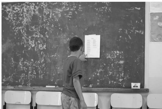
A Brazilian student reads a poem in English.