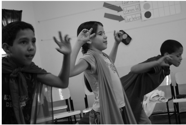
Students perform in front of their class.

Actually, if there were reasons for literature and poems to exist, I do believe one of these