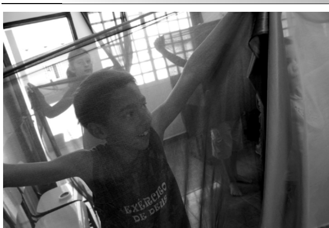
Students rehearse performances.

By beginning with an emphasis on "Building Community," students and teachers create a safe space whereby they feel comfortable taking risks writing and sharing work that matters to them and may be of a personal nature. "Entering Text" involves, through visual or performative teaching approaches, inspiring students to want to read the text in and out of the classroom. In "Comprehending Text," students read the text deeply and wrestle with questions that get at the aesthetic and intellectual center of the text. They read beyond a search for surface answers such as, "Who is the protagonist?" or "What is the setting?" and instead wrestle with the text's central ideas. By "Creating Text," students become actors in the world rather than passive receivers of information. Inspired by their reading of the text, they create their own new and original work. Finally, they "Rehearse and Revise" their work until they feel it is excellent, at which time it is exhibited for the larger community in the form of performances or art exhibitions. Throughout the process, teachers and students engage in "reflection" by taking the time out from the sometime hurried move towards the culminating event to step back and consider how they might improve the artwork, a piece of writing, or a theatrical scene.